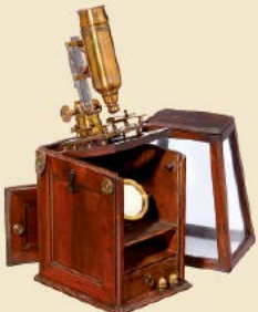
French box microscope, c. 1760 Sold: 12.600 € / $ 14.615