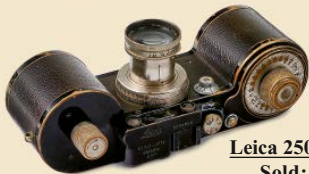
Leica 250 FF, c. 1932 Sold: 6.045 € / $ 7.310