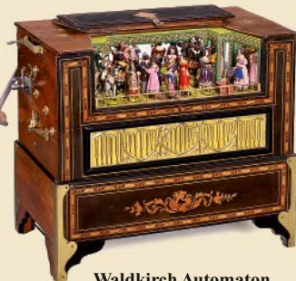
Waldkirch Automaton Organ by Bruder, c. 1860 Sold: 56.673 € / $ 65.740