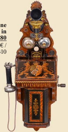
Ericsson telephone for the royal palace in Oslo, c. 1880 Sold: 76.990 € / $ 89.310