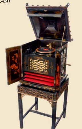
Aeolian Vocalian chinoiserie cabinet gramophone, London, c. 1920 Sold: 20.150 € / $ 24.380

thesaleroom The home of art & antiques auctions