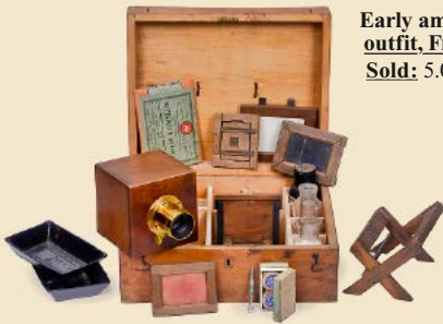
Early amateur camera outfit, France, c. 1880 Sold: 5.035 € / $ 6.090