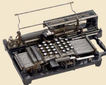
"Thürey" typewriter, Thürey-Schreibmaschinen-Gesellschaft, Köln-Deutz, c. 1909 Sold: 55.000 € / $ 64.350