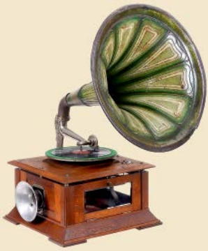
Maestrophone hot-air engine horn gramophone, Paillard, St. Croix, Switzerland, c. 1907 Sold: 10.075 € / $ 11.690