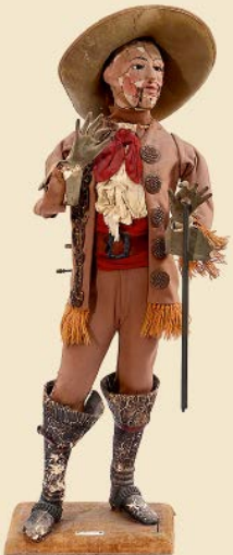
"Buffalo Bill" smoking automaton by Gustave Vichy, c. 1890 Sold: 6.550 € / $ 7.665