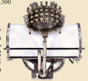
"Writing Ball" by Rasmus Malling-Hansen, Copenhagen, No. 25, 1867 Sold: 174.840 € / $ 204.560