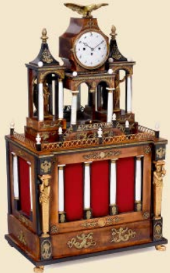
Rare Austrian musical flute clock, c. 1830-40 Sold: 15.110 € / $ 17.680