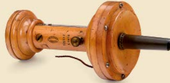
Early telephone by L.M. Ericsson, Stockholm, c. 1878 Sold: 18.130 € / $ 21.030