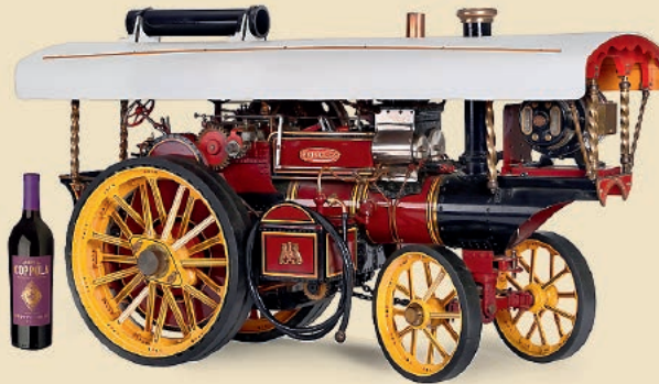
2-Inch Scale Model of a Fowler Steam Showmans Engine Estimate: 5.000–8.000€ / 5,700–9,200 US$