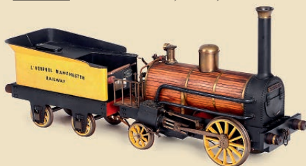
5-inch Gauge Rainhill Style Locomotive with Tender, c. 1980 Estimate: 1.800–2.500€ / 2,000–2,900 US$