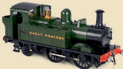
Well-Engineered 1-Inch Scale British Live Steam Locomotive GWR 1451 Estimate: 2.500–3.500€ / 2,900–4,000 US$