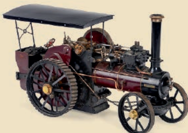
1 1/2-inch Scale Model of a Live Steam Traction Engine, c. 1984 Estimate: 3.000–4.000€ / 3,400–4,600 US$