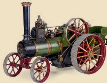
Three-inch Scale Model of a Burrell Live Steam Traction Engine, c. 1975 Estimate: 5.000–7.000€ / 5,700–8,000 US$