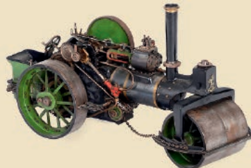
British Single-Cylinder Live Steam Street Roller, c. 1970 Estimate: 1.800–2.500€ / 2,000–2,900 US$