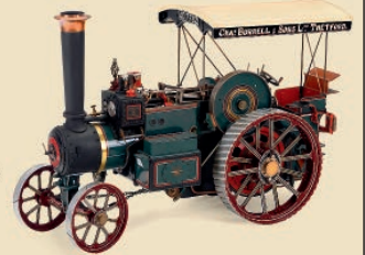
2-inch Scale Working Model of a Burrell Traction Engine Estimate: 4.000–5.000€ / 4,600–5,700 US$