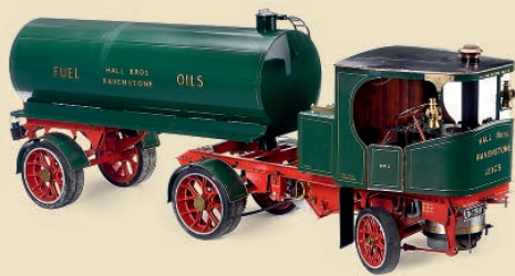
Two-inch Scale Model of a Clayton Undertype No. 2 Steam Wagon with Trailer Estimate: 3.000–5.000€ / 3,400–5,700 US$