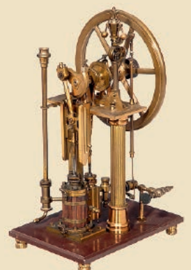
Working Model of a Single-Cylinder Overcrank Steam Engine, c. 1920 Estimate: 1.300–1.800€ / 1,500–2,000 US$

invaluable The world's premier auctions and galleries