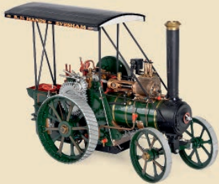
Model of a British Single-Cylinder Live-Steam Traction Engine with Rope Winch, c. 1970 Estimate: 2.500–3.500€ / 2,900–4,000 US$