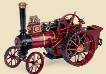
Live-Steam 1:8 Scale Model of a Traction Engine, c. 1975 Estimate: 2.400–3.000€ / 2,700–3,400 US$