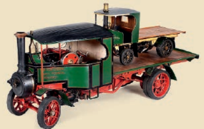
Three-inch Scale Model of a Foden Overtype Steam Lorry Estimate: 5.000–7.000€ / 5,700–8,000 US$