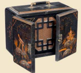
Emerson H4 "Oriental Garden" Chinoiserie Cabinet Radio, c. 1933 Emerson Radio & Phonograph Corp., New York. Five-tube receiver. Estimate: 800 – 1.200 € / 920 – 1.380 US$