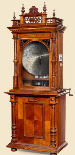
Polyphon Style 105 Disc Musical Box, c. 1900 Estimate: 12.000 – 15.000 € / 13.680 – 17.100 US$