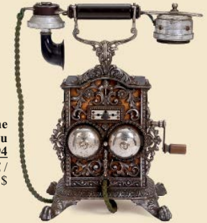
Rare Deluxe Telephone by Elektrisk Bureau Kristiania, c. 1894 Estimate: 6.000 – 8.000 € / 6.840 – 9.120 US$