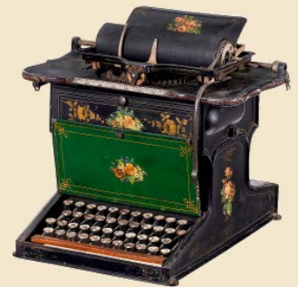
Sholes and Glidden Typewriter, E. Remington & Sons, 1873 Estimate: 15.000 – 20.000 € / 17.100 – 22.800 US$