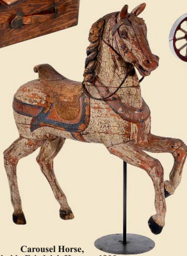
Carousel Horse, probably Friedrich Heyn, c. 1900 Estimate: 2.000 – 3.000 € / 2.260 – 3.420 US$