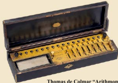
Thomas de Colmar "Arithmomètre", c. 1870 Estimate: 3.500 – 4.500 € / 3.960 – 5.130 US$