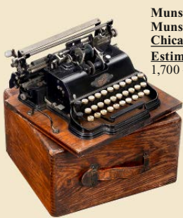
Munson Model 2 Typewriter, Munson Typewriter Co., Chicago, 1895 Estimate: 1.500 – 2.000 € / 1.700 – 2.300 US$