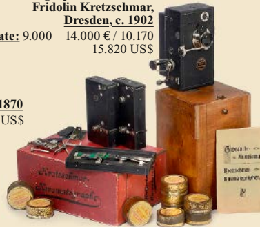
Kretschmar Kinematograph, Kinematographen-Bauanstalt Fridolin Kretschmar, Dresden, c. 1902 Estimate: 9.000 – 14.000 € / 10.170 – 15.820 US$