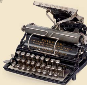
"The Fitch Typewriter", Fitch Typewriter Co., Brooklyn, 1891 Estimate: 12.000 – 16.000 € / 13.560 – 18.080 US$