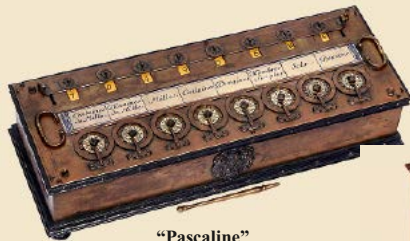
"Pascaline" (or "Arithmatique") Replica Estimate: 12.000 – 15.000 € / 13.560 – 17.100 US$