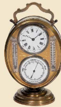
French Desk Timepiece with Barometer and Thermometers, c. 1890 Estimate: 700 – 1.000 € / 790 – 1.140 US$