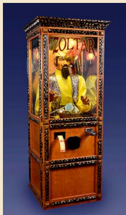
"Zoltar Speaks" Fortune Teller, Characters Unlimited, Boulder City, Nevada Estimate: 5.000 – 7.000 € / 5.650 – 7.910 US$