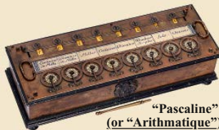
“Pascaline” (or “Arithmatique”) replica Estimate: 12,000 – 15,000 € / 13,560 – 17,100 US$