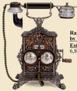
Rare Deluxe Telephone by Elektrisk Bureau Kristiania, c. 1894 Estimate: 6,000 – 8,000 € / 6,840 – 9,120 US$