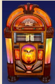
Rock-Ola “Harley Davidson” Jukebox, 2002 Estimate: 8,000 – 10,000 € / 9,120 – 11,400 US$