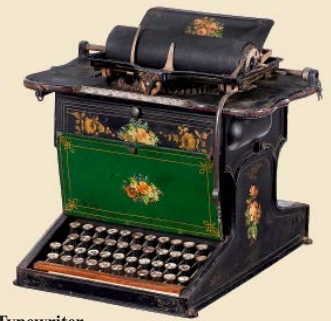
Sholes and Glidden Typewriter, E. Remington & Sons, 1873 Estimate: 15,000 – 20,000 € / 17,100 – 22,800 US$