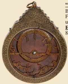
“Persian Astrolabe”, 17 th Century Brass body and throne. Full technical description upon request or via QR-code. Estimate: 75,000 – 100,000 € / 85,000 – 115,000 US$