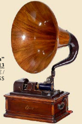
Deluxe “Edison Opera” Phonograph, c. 1913 Estimate: 6,000 – 7,000 € / 6,840 – 7,980 US$