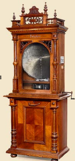
Polyphon Style 105 Disc Musical Box, c. 1900 Estimate: 12,000 – 15,000 € / 13,680 – 17,100 US$