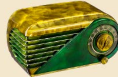
Art-Deco “Bullet” Radio in Catalin Case, Farnsworth Television & Radio Corp., c. 1948 Estimate: 800 – 1,200 € / 910 – 1,370 US$