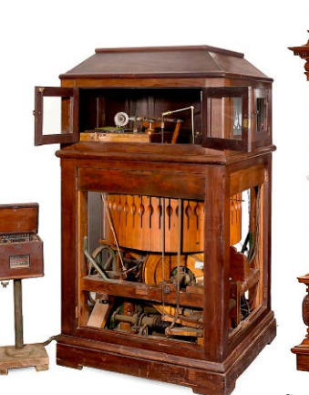
Symphonion 'Eroica Triple-Disc Musical Hall Clock, c. 1895 Sold for: € 43,000 / US$ 47.700