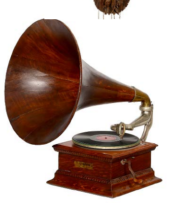
Monarch Gramophone with Mahogany <u>Horn, c. 1907</u>

Estimate: € 12,000 – 18,000 / US$ 12,800 – 19,300