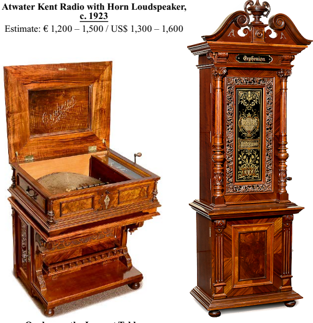
»Orphenion« No. 106 Disc Musical Box, c. 1900

With matching stand. Estimate: € 12,000 – 16,000 / US$ 12,700 – 17,000