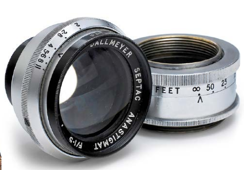
Dallmeyer »Septac 1,5/2 in.«, c. 1950

Levy-Roth, Berlin. The first 35mm camera in Europe. Estimate: € 2,500 – 3,500 / US$ 2,700 – 3,700