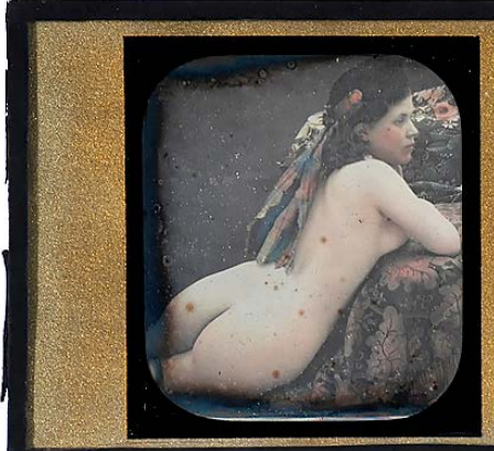
French Stereo Nude Daguerreotype, c. 1845

With Biogon 4,5 /38 mm − Estimate: € 7,000 − 10,000 / US$ 7,400 − 10,600