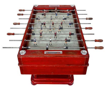
Vintage Table Football Game, c. 1940s

By General Electric Co., London Estimate: € 1,500 – 1,800 / US$ 1,600 – 1,900