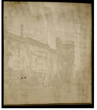
Photogenic Drawing of Lacock Abbey, May 1839 Sir William Henry Fox Talbot, England Sold for: € 14,750 / US$ 16,700