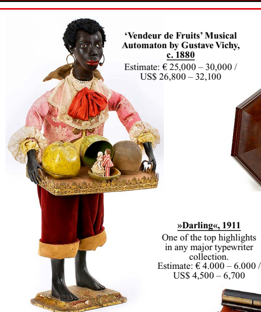
'Vendeur de Fruits' Musical Automaton by Gustave Vichy, <u>c. 1880</u> Estimate: € 25,000 – 30,000 /