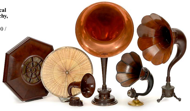
Selection of Radio Loudspeaker Horns, 1920s

Estimates from: € 300 - 1,000 / US$ 320 - 1,100