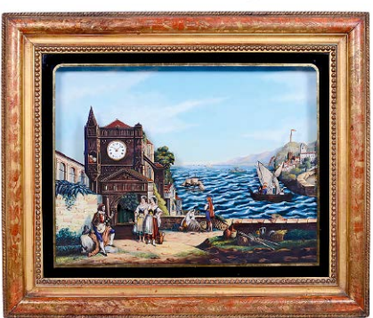
Musical Automaton Picture Clock <u>by Xavier Tharin, c. 1870</u> Estimate: € 10,000 – 15,000 /

Estimate: € 8,000 – 12,000 / US$ 8,600 – 12,800