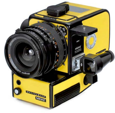
NASA Hasselblad MKWE No. 284, c. 1985

Estimate: € 2,500 – 3,500 / US$ 2,700 – 3,700