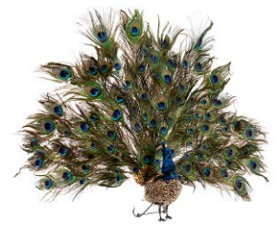
'Paon Marchant' Automaton, c. 1910 Roullet et Decamps, Paris Sold for: € 11,000 / US$ 12,300