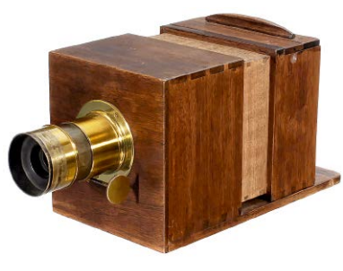
Sliding Box Daguerreotype Camera, c. 1850 With Lerebours lens Sold for: € 8,600 / US$ 9,700