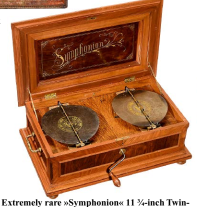
Disc Musical Box, 1905 and later

Estimate: € 12,000 – 18,000 / US$ 12,800 – 19,300