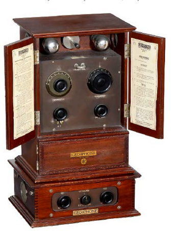
Gecophone BC 2001 Radio, 1922

By Bruno Rückert, Leipzig. Estimate: € 15,000 – 18,000 / US$ 15,900 – 19,000