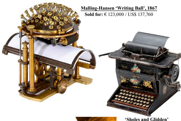
Typewriter, 1873 E. Remington & Sons, New York Sold for: € 29,500 / US$ 33,000

Disc musical boxes again proved particularly popular. In the November 2016 auction a rare original terracotta Symphonion 'Gambrinus' (Belgian Beer King), c. 1897 with provenance, letters and photographs from the original inn where he had held court for over 100 years, brought € 24,600 / US$ 27,300. A no less regal Symphonion 'Eroica', c. 1895 triple-disc hall clock commanded € 43,000 / US$ 47,700.