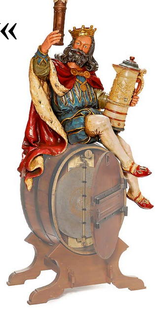
Rare Original Terracotta Symphonion 'Gambrinus' Figure, c. 1897

We look forward to assisting old and new customers at the preview.